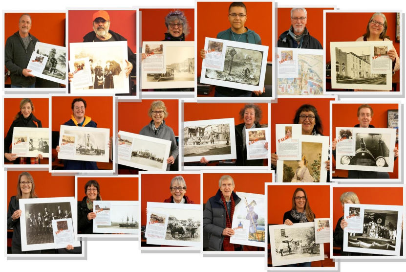
The winners of the prize draw!

One of the 18 prize draw winners told us that she and her friends had spent two hours in the gallery, trying to work out which of the stories were true, and which were false. They spent so long there, in fact, that she ended up with a parking ticket!