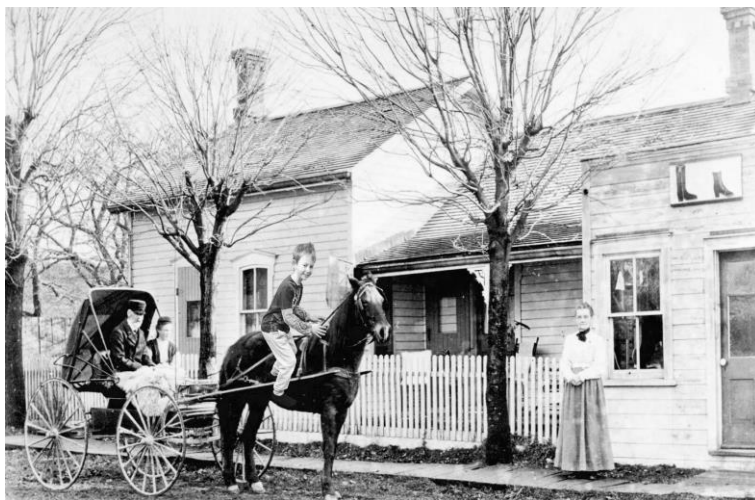
Another sample photo from the community.

When we can, we try to keep the conversation going after the event to solidify our connection and put our resources directly into their inbox. If they requested a digital image, we follow up with a friendly email message thanking them for visiting us and inviting them to visit us in the future. We encourage them to follow us on social media, explore our online database, and reach out to us with any questions they might have about our services. This has led to donation offers, in-person visits and online reference requests.