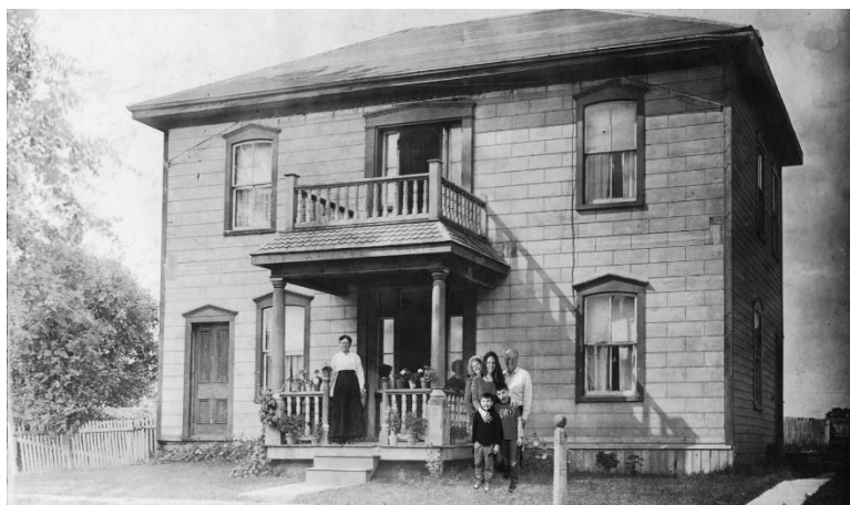
Example of one of the many photographs participants receive.

The program was implemented in partnership with the Elgin County Library, and this partnership has been invaluable to the success of the program. The county's public library system has ten branches situated at the heart of the rural communities of Elgin County, and each branch has an established user base that regularly attends library programming. This allowed us to cross-promote the event and provided us with an engaged audience to which we could bring our activity.