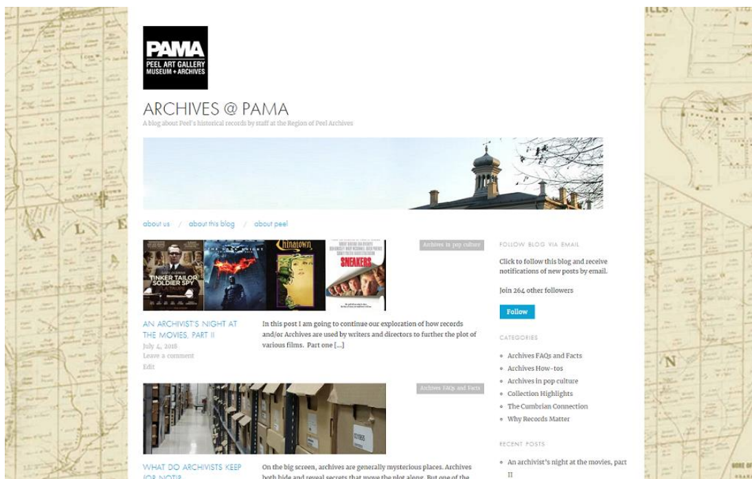
Homepage of the Region of Peel Archives' blog.

Three years ago the Region of Peel Archives launched a blog, both as an outreach experiment and as a contribution to Archives Awareness Week in the province. We've been pleasantly surprised by the influence and geographical reach of the blog, simply named "Archives @ PAMA" (found at https://peelarchivesblog.com/ ). We have accumulated 89,000 views in over 180 countries and our posts are linked to and recommended by a range of institutions and interested users. Here we offer some reflections on our experience so far.