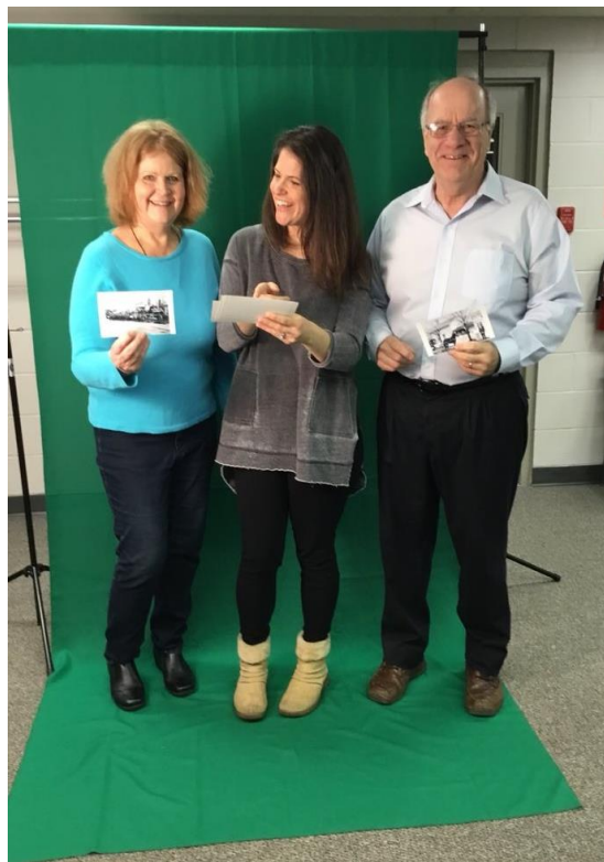
Program participants standing in front of the green screen.

The program has been very well-received within the community and continues to gain in popularity as we share the "time travel" images on our social media platforms after events. We have recently expanded the program beyond our partnership with the library to other cultural