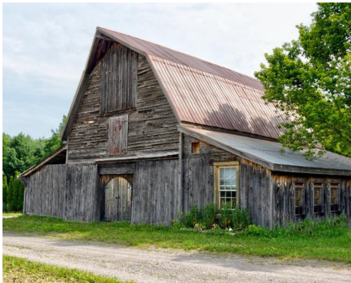
This charming 1901 barn on Goodfellow Road was a calendar favourite.