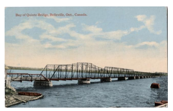
Bay of Quinte Bridge, vintage postcard